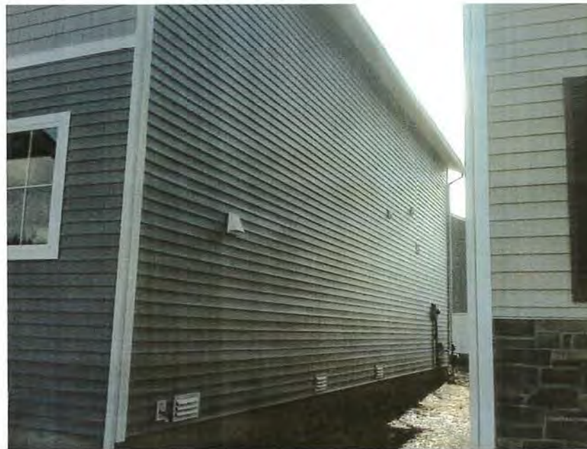
Lot 3 West Face 10-20-08