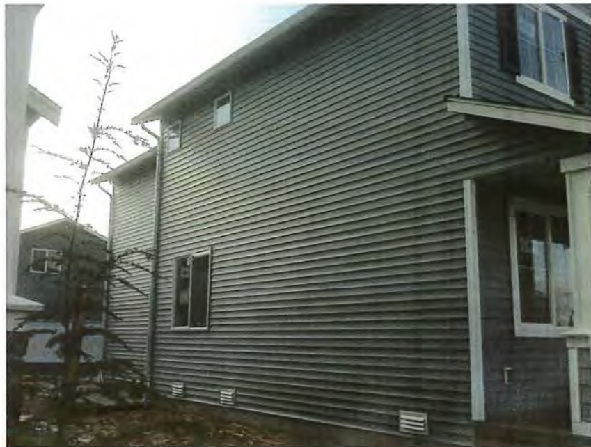
Lot 3 East Face 10-20-08