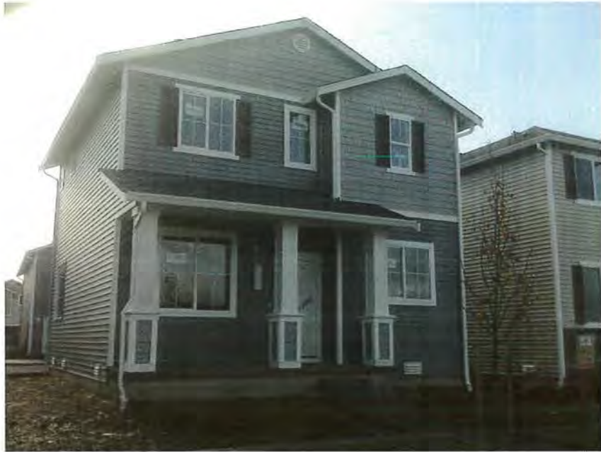
Lot 3 North Face 10-20-08

If using the Elevation Certificate to obtain NFIP flood insurance, affix at least two building photographs below according to the instructions for Item A6. Identify all photographs with: date taken; "Front View" and "Rear View"; and, if required, "Right Side View" and "Left Side View." If submitting more photographs than will fit on this page, use the Continuation Page, following.