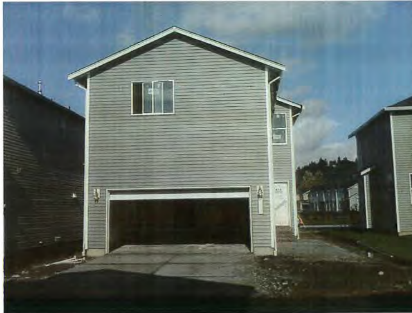
Lot 3 South Face 10-20-08

If submitting more photographs than will fit on the preceding page, affix the additional photographs below. Identify all photographs with: date taken; "Front View" and "Rear View"; and, if required, "Right Side View" and "Left Side View."